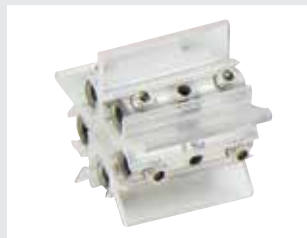
DBC-2C connector 5 × 1,5 - 6 mm 2 , mono and multi cable wire, rigid and stranded