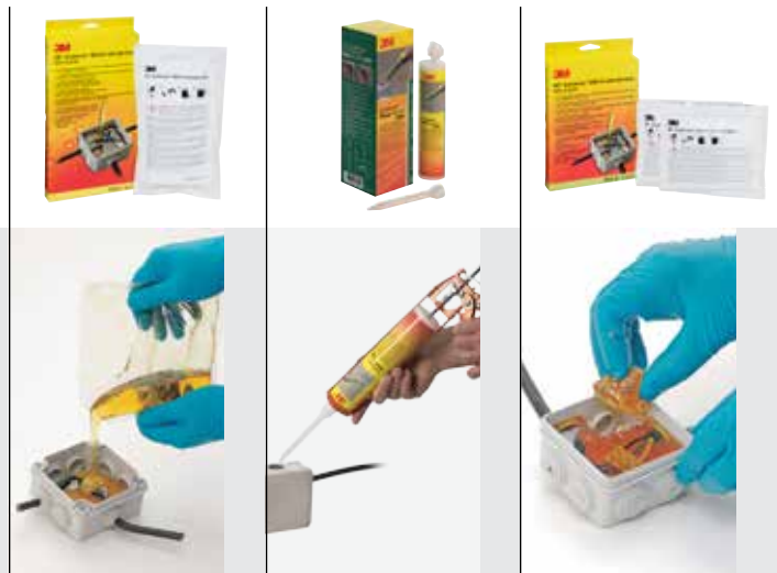
Bi-component bags for quick box filling