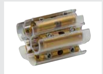
DBC-3C connector 5 × 2,5 - 16 mm 2 , mono and multi cable wire, rigid and stranded