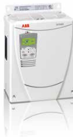
ABB industrial drives offer flexibility for a broad range of applications

Fits with all process applications, providing high flexibility and scalability up to 5200 A per single module