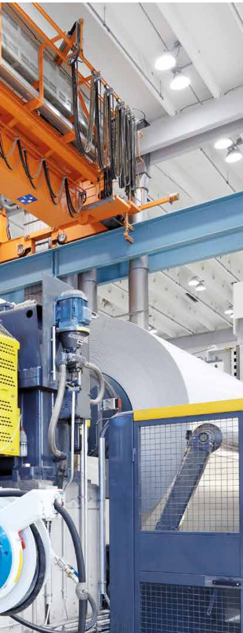
ABB low voltage AC drives

The ABB low voltage AC drives product range, from 0.18 to 5600 kW, is the widest selection available from any manufacturer. These drives establish the global benchmark signifying reliability, simplicity, flexibility and ingenuity throughout the entire life cycle of the drive.