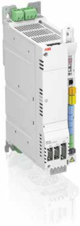
ABB motion control drives

Versatile motion control drive with integrated real-time EtherNet technology