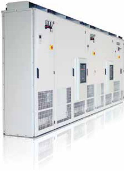
ABB industrial drives offer flexibility for a broad range of applications

Complete delivery of a tested drive system in a compact enclosure