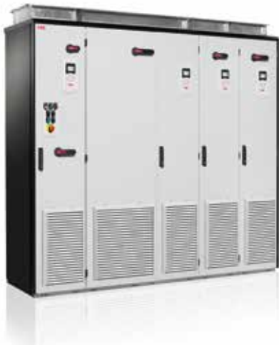
All-compatible space-saving multidrives