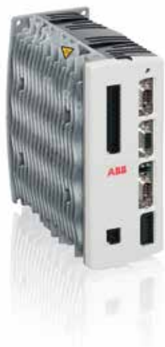
Compact motion control drive for simple applications