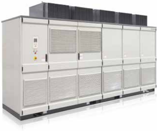
ABB general purpose and industrial drives offer ease-of-use with standard motors

Effortless energy efficiency for a wide range of applications