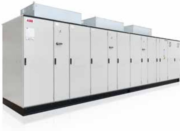
Superior arc protection for a high level of personal safety