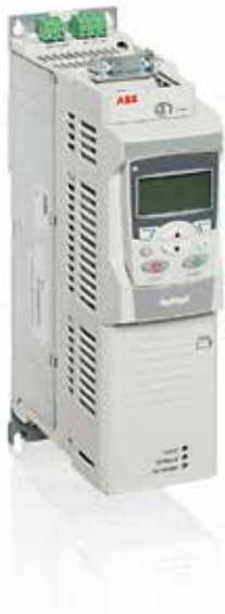
ABB drives for water and wastewater

Designed for water and wastewater processes with built-in pumping functions