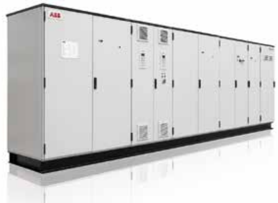
Modular drive for demanding applications

Special purpose drives are engineered drives, typically used for high power, high speed or special performance applications such as test stands, marine propulsion and thrusters, rolling mills, SAG and ball mills, large pumps, fans and compressors.