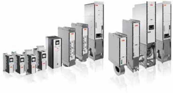
All-compatible drive modules for easy cabinet assembly