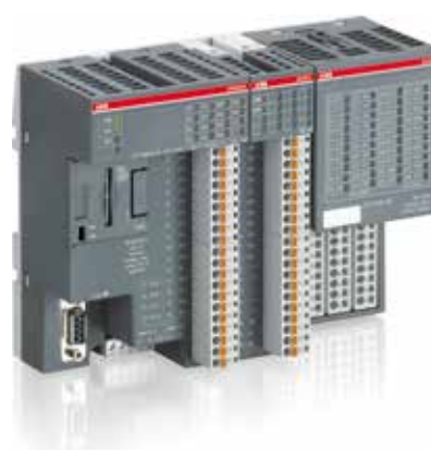
Cost-effective and compact PLC