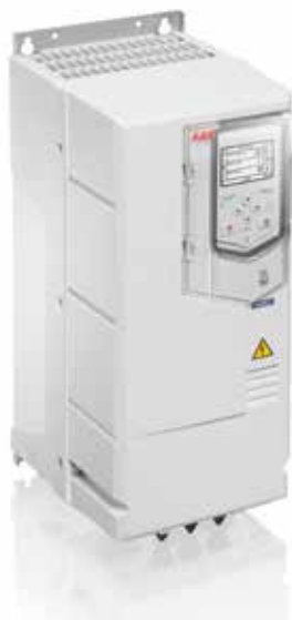
ABB drives for elevators

Comprehensive climate control, effortless operation