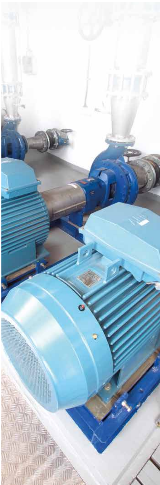
ABB industry specific drives tailored to save energy and money

ABB industry specific drives provide our customers with dedicated drive solutions for AC motor control used in industries and applications such as HVAC, water and wastewater and elevators. Working closely with these industries, we have developed targeted functionality to help you improve your overall operating performance while also helping to reduce energy use. Built-in application macros in the drives help you easily set up and tailor the drives to meet the needs of your processes.