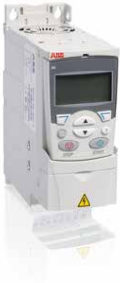
ABB general purpose drives offer ease-of-use

Built-in features for pump and fan applications