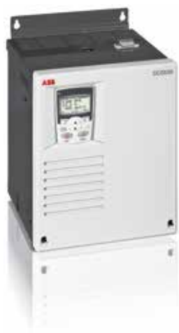
ABB standard drives designed for machine manufacturers

Ideal drive for machinery manufacturers with its compact dimensions and robust technology