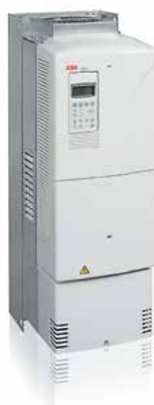
Complete regenerative drives in a compact package

Single drives are complete AC drives, which can be installed without any additional cabinet or enclosure. A single drive configuration contains a rectifier, optional EMC filter, reactor, DC link and an inverter in one single AC drive unit. Single drives are available as wall-mounted, free-standing and cabinet-built constructions. The key features of these drives are programmability and configurability during both ordering and commissioning, which makes adaptation to different applications easy.