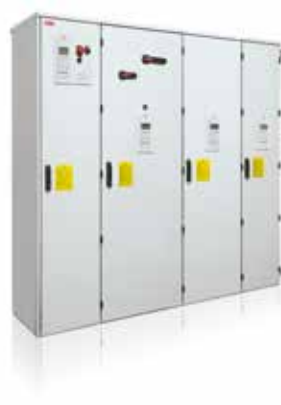
Liquid-cooled process control in a compact package

ABB's multidrives are built from ABB industrial drive modules connected to a common DC bus. This enables a single power entry and common braking resources for several drives.