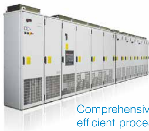
Comprehensive and efficient process control