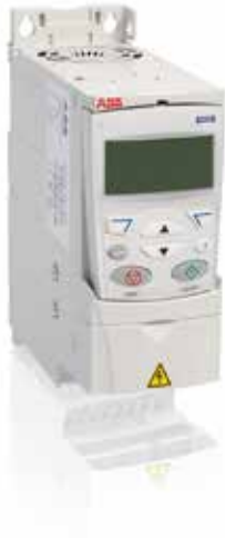
ABB drives for HVAC

The compact drive for HVAC pump and fan OEM applications up to 4 kW