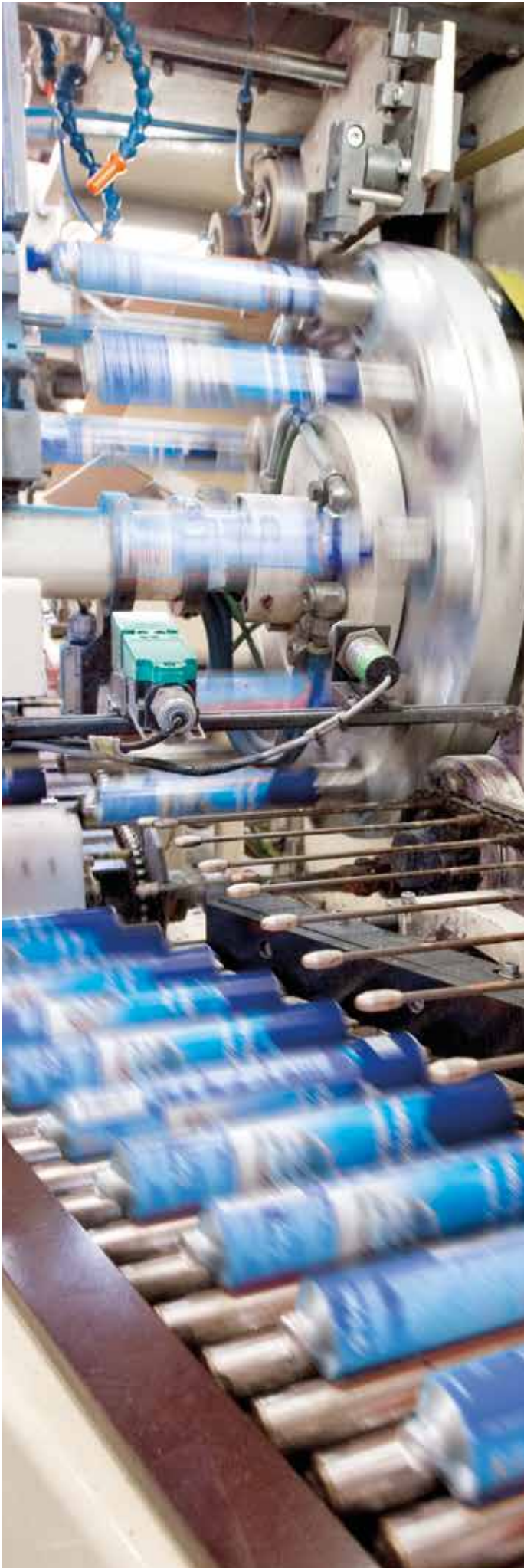
ABB motion control drives provide capability without complexity

ABB motion control drives offer flexible technologies and high performance motor control to solve a wide variety of applications. The range includes powers from less than 1 kW to more than 100 kW. The drives enable operation with single and three-phase supplies for global markets, and have open communication options as well as real-time EtherNet technologies such as EtherCAT® and POWERLINK.