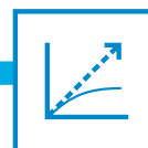
Life cycle management