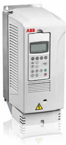
Wall-mounted industrial drives with everything built-in