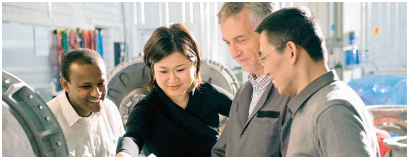
ABB authorized value providers are members of the ABB channel program – the ABB Value Provider Program. They are fully trained, regularly audited and officially authorized to represent the defined ABB products and services. With their in-depth knowledge of local markets and expertise in selected products and services, they can ensure speed, efficiency and consistency in daily operations. Their work ensures that ABB products are backed by the same high standards of service and support all over the world.

The ABB authorized value provider network provides more choices and flexibility when buying ABB products and services. The network members deliver sales, support, service and engineering in seamless cooperation with ABB.