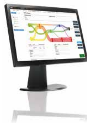
ABB zenon IoT software