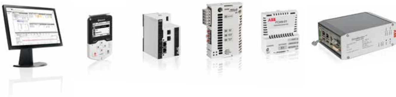
ABB drives are connected to automation systems using embedded protocols and fieldbus adapters. All major fieldbus protocols are supported allowing flexibility and compatibility with the automation system. Different software tools and remote monitoring solutions offer support throughout the drive's life cycle.