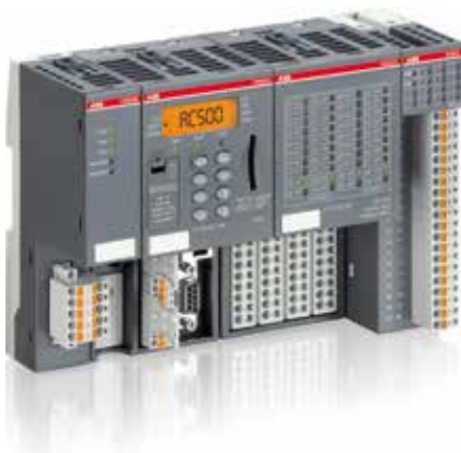
Powerful PLC offering with a wide range of performance levels