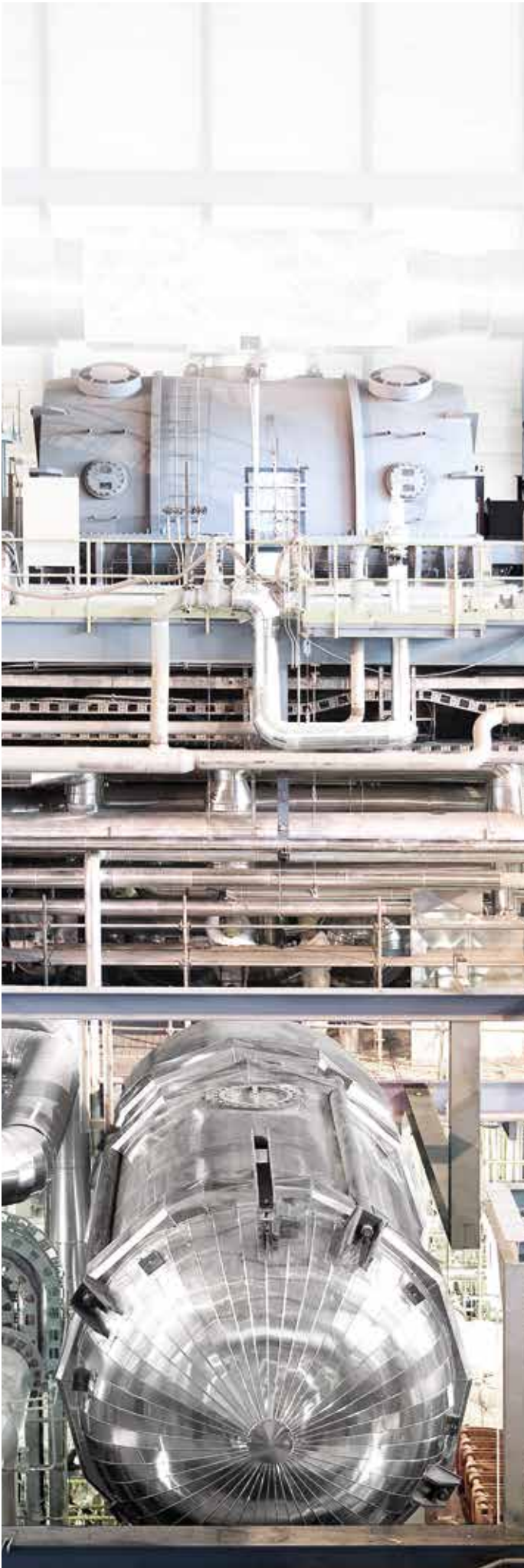
ABB industrial drives for comprehensive solutions for all industries

ABB industrial drives are highly flexible AC drives that enable uncompromised productivity for industrial applications. The drives cover a power and voltage range up to 5600 kW and 690 V. The drives are designed for heavy industrial applications such as those found in pulp and paper, metals, mining, cement, power, chemical, oil and gas, water and wastewater, marine, and food and beverage.