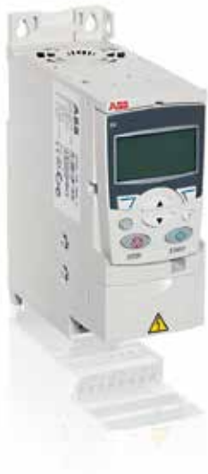
ABB machinery drives for flexible needs

Compact and easy drives to install, set and commission