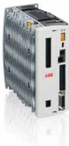
Compact motion control drive with embedded safety and EtherCAT® technology