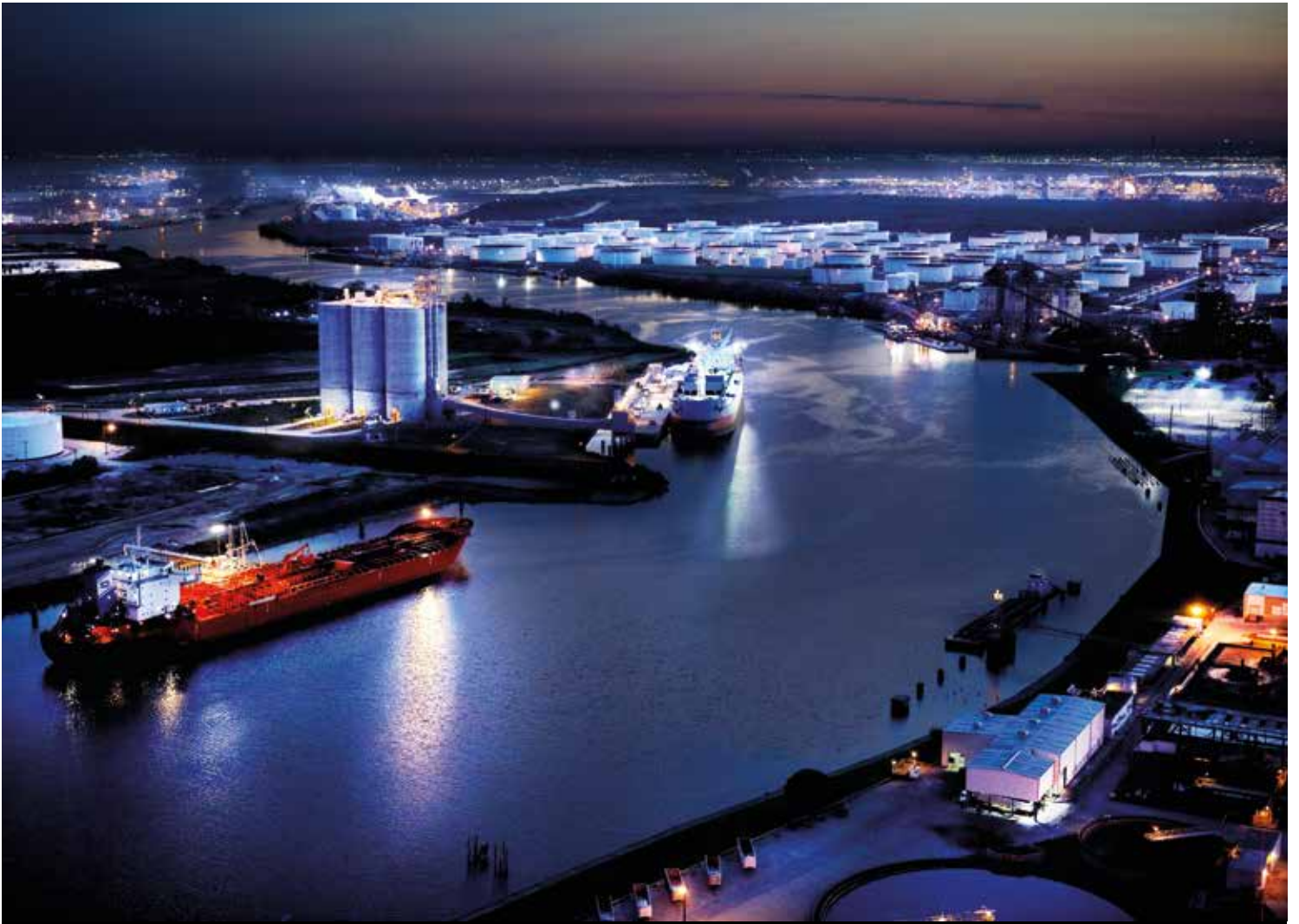
ABB drives and controls The green guide to more profitable business