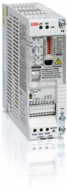
ABB micro drives for basic applications

Little big drives easy to set up using switches