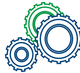
ABB provides a one-year warranty for the whole drive or module.