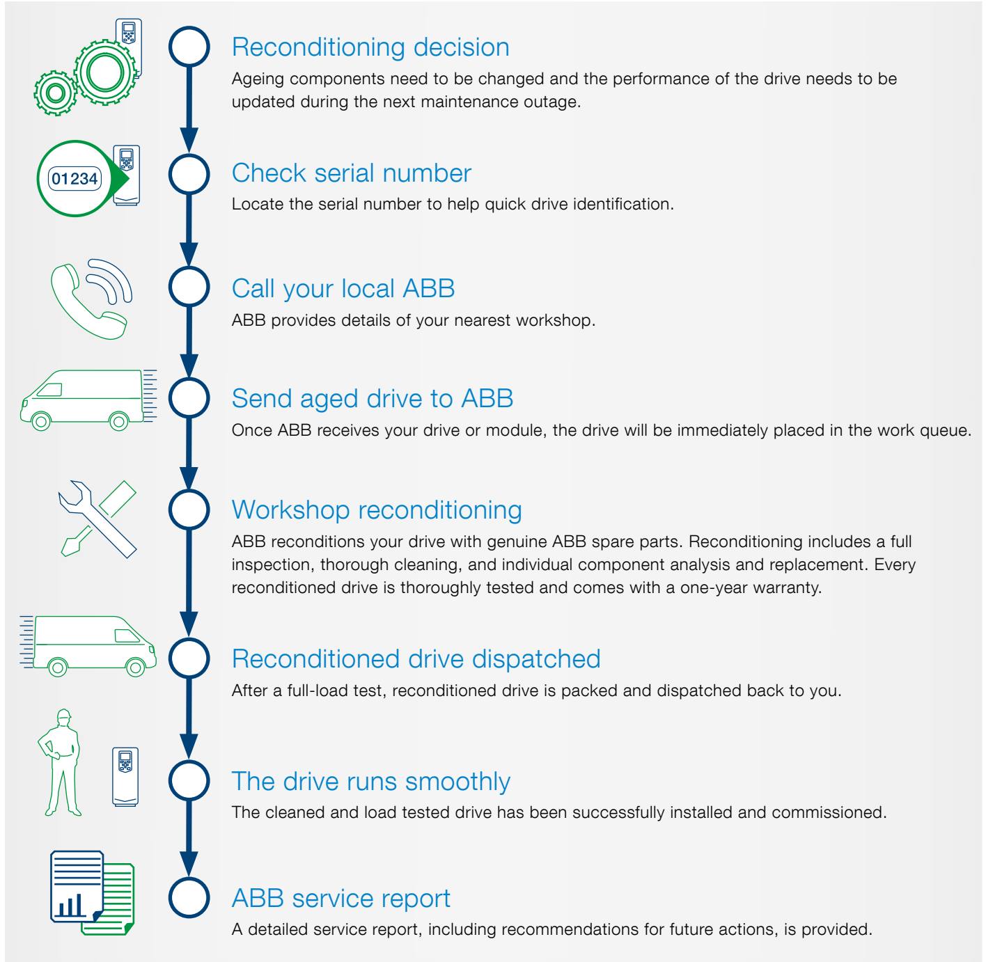
ABB Reconditioning service delivery