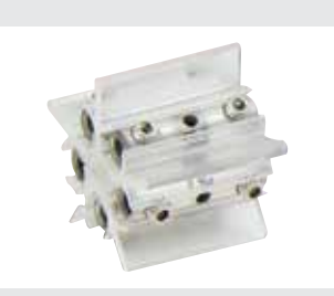
DBC-2C connector 5 \times 1,5 - 6 \text{ mm}^2 , mono and multi cable wire, rigid and stranded